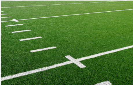
Artificial Turf Infill